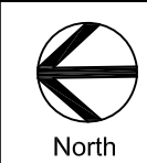
Figure 1 Recommended Improvement Projects Auburn Citywide Traffic Study Auburn, Alabama July 2019